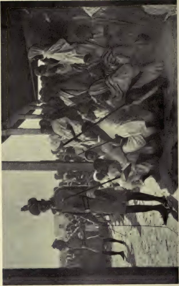
SCENE OUTSIDE ZEILA COURT-HOUSE.